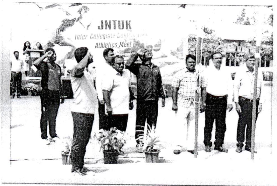
Flag Hosting on JNTUK Athletics Central Zone Meet - 2018